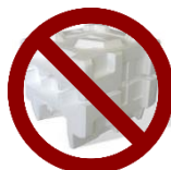
NO Styrofoam or Packaging Materials