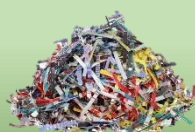
Shredded Paper (In Office Paper, unbagged)

No! Do not recycle in curbside bins or at Collection and Recycling Centers. Reuse or put in garbage.