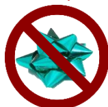
NO Bows or Ribbons

No! Do not recycle in curbside bins or at Collection and Recycling Centers. Reuse or put in garbage.