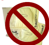
NO Padded Envelopes