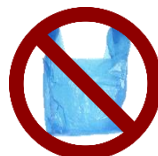
NO Plastic Bags