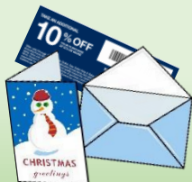
Greeting Cards, Envelopes, Flyers & Unwanted Mail (in Mixed Paper)