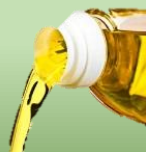
Used Cooking Oil (Under carport cover)