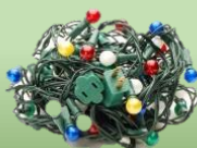
Christmas Lights (With Scrap Metal)