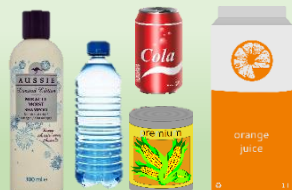
Plastic Containers, Metal Cans, Cartons

Only recycle at Collection and Recycling Centers; not in curbside bins.