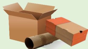
Cardboard Boxes & Tubes

Yes! Recycle in your curbside bin or at Collection and Recycling Centers.