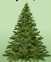
Christmas Trees (Real in 'Clean Wood Waste' & Artificial in 'Scrap Metal')

Only recycle at Collection and Recycling Centers; not in curbside bins.