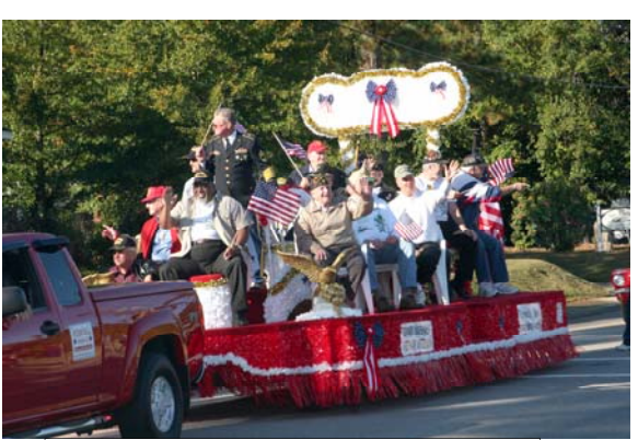
Grand Marshalls — Vietnam Veterans