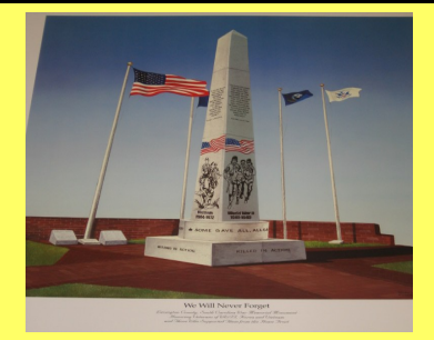
Veteran's Monument across from the Administration Building

Appointments for outreach dates are greatly appreciated. Please call the office to schedule.