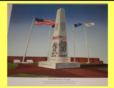
Veteran's Monument across from the Administration Building

Appointments for outreach dates are greatly appreciated. Please call the office to schedule.