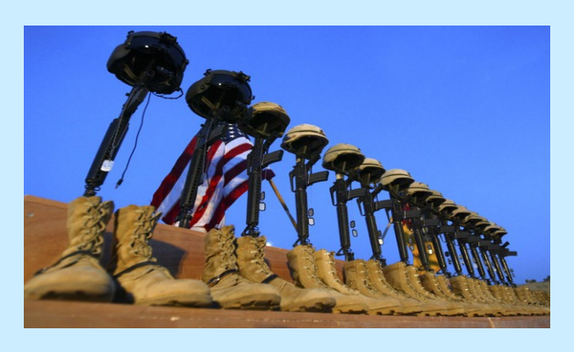
You are invited to a