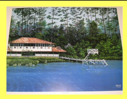
Gibson's Pond in Lexington