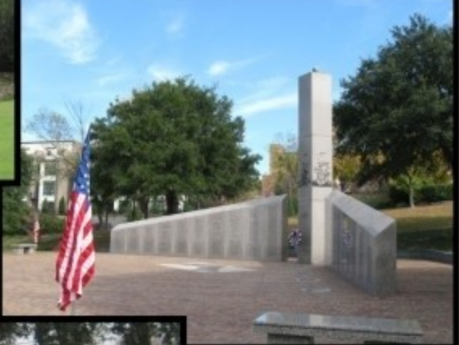
S.C. Vietnam Monument ★

Proposed South Carolina War Dog Monument ★